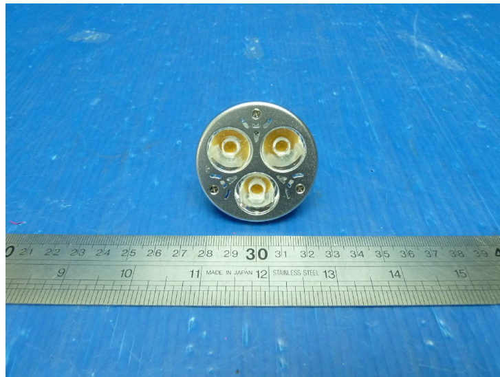
Figure 1 model 50-32MR

The apparatus as supplied for the test is a MR16 LED bulb, model 50-32MR for residential use and the product is a LED bulb with build-in electronic driver.